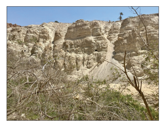
A photo of Engedi. "Now when Saul returned from pursuing the Philistines, he was told, saying, 'Behold, David is in the wilderness of Engedi.' Then Saul took three thousand chosen men from all Israel and went to seek David and his men in front of the Rocks of the Wild Goats." 1 Samuel 24:1-2